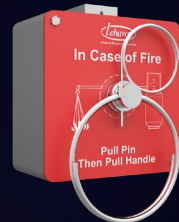
Manual Pull Station